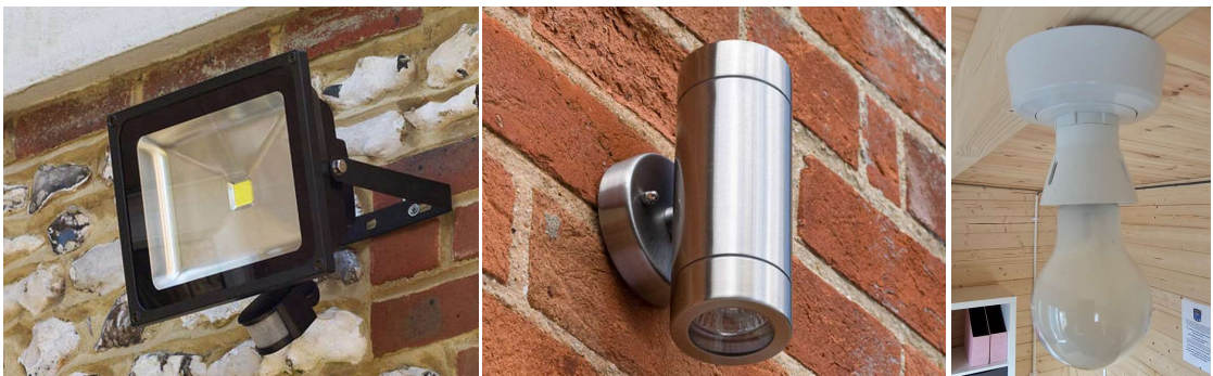
LED PIR floodlight Up/down light Batten light Note the exact style of the fittings may vary and will depend upon availability at the time.